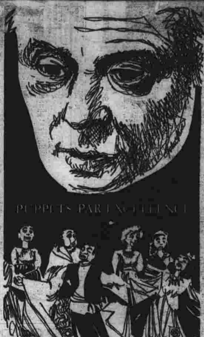
The entire hour of Ed Sullivan's December 1 show will be devoted to the world-famous Obratsov Puppets from Moscow. They are under the direction of their creator, 62-year-old Sergei Obratsov, whom many call the world's greatest puppeteer. His company of 200 presents "An Unusual Concert," a two-part parody of life that is really an anthology of Obratsov's work, characterized by satire both gentle and savage.