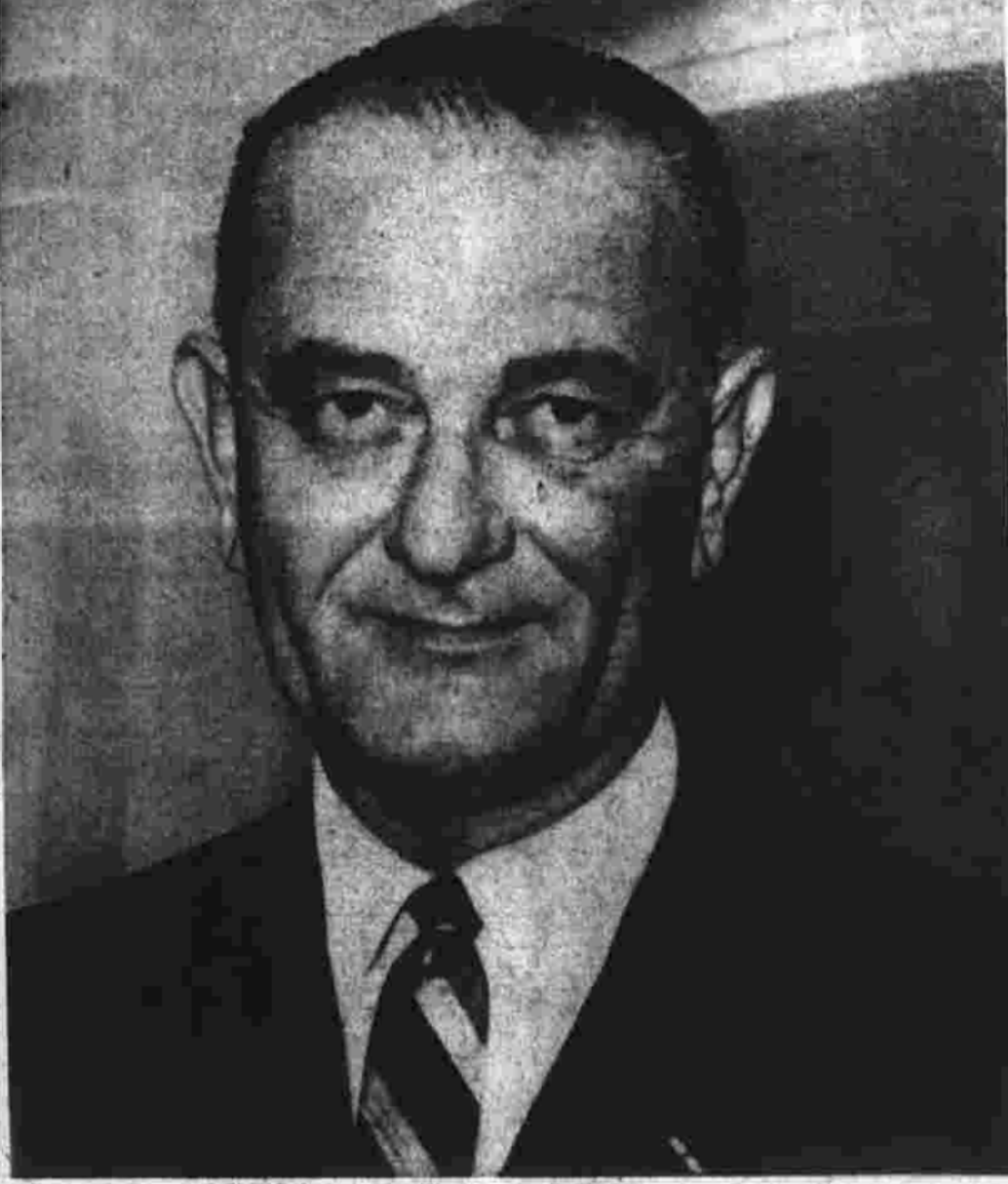
Lyndon B. Johnson

Area Suspends Activities in Mourning--See Story on Page 3