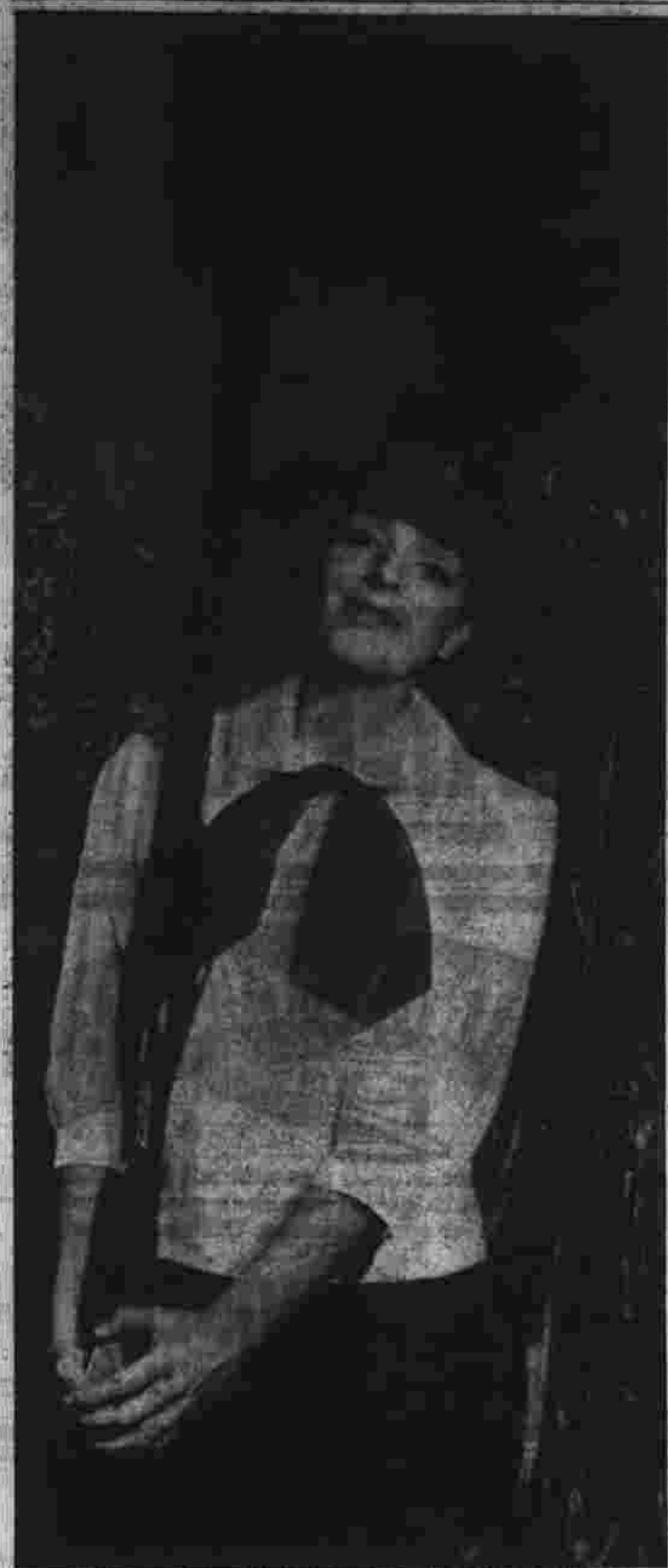
"A Happy Thanksgiving to everybody including the turkey" seems to be Lisa Minelli's sentiments as she warms up for her stint on the "Arthur Godfrey Thanksgiving Show" (NBC Nov. 28, 10 p.m.). Other notables taking part in the special colorcast are Carol Lawrence, Shari Lewis, Orson Bean and Tony Bennett.

VIDEO EVERY WEEK—ALL RIGHTS RESERVED, H. T. DICKINSON & CO., Inc.