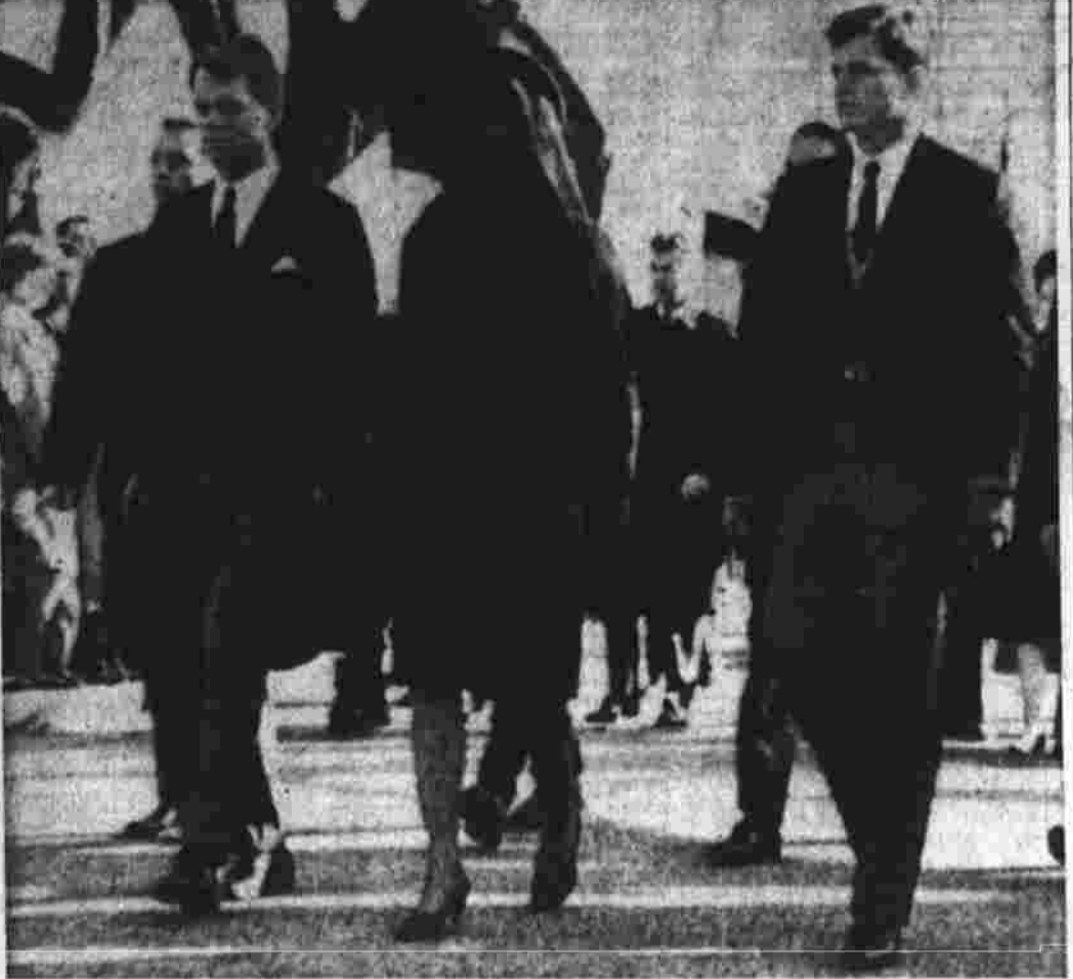
Mrs. Kennedy and Robert and Edward Kennedy head procession behind body of President.

The procession from the White House began at 11:40 a.m. The cortege had moved from the Capitol where Kennedy's body lay in state this weekend, to the White House.