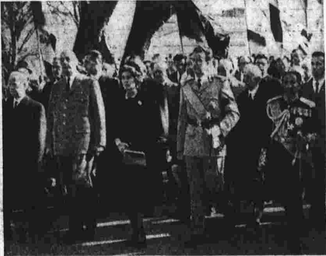
Marchers from left are Heinrich Lubke, West German president; French president Charles de Gaulle; Queen Frederika of Greece; King Baudouin of Belgium; Emperor Haile Selassie of Ethiopia.