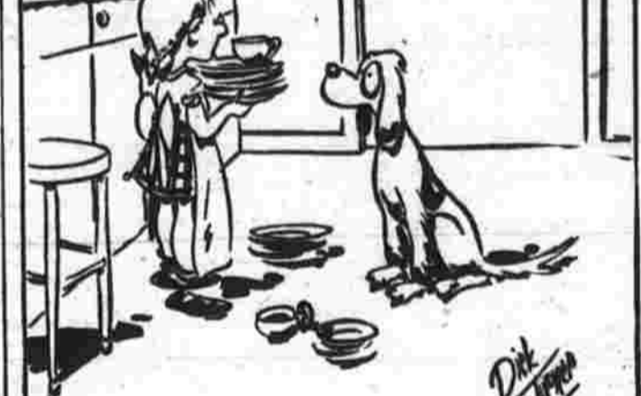
OUT OUR WAY